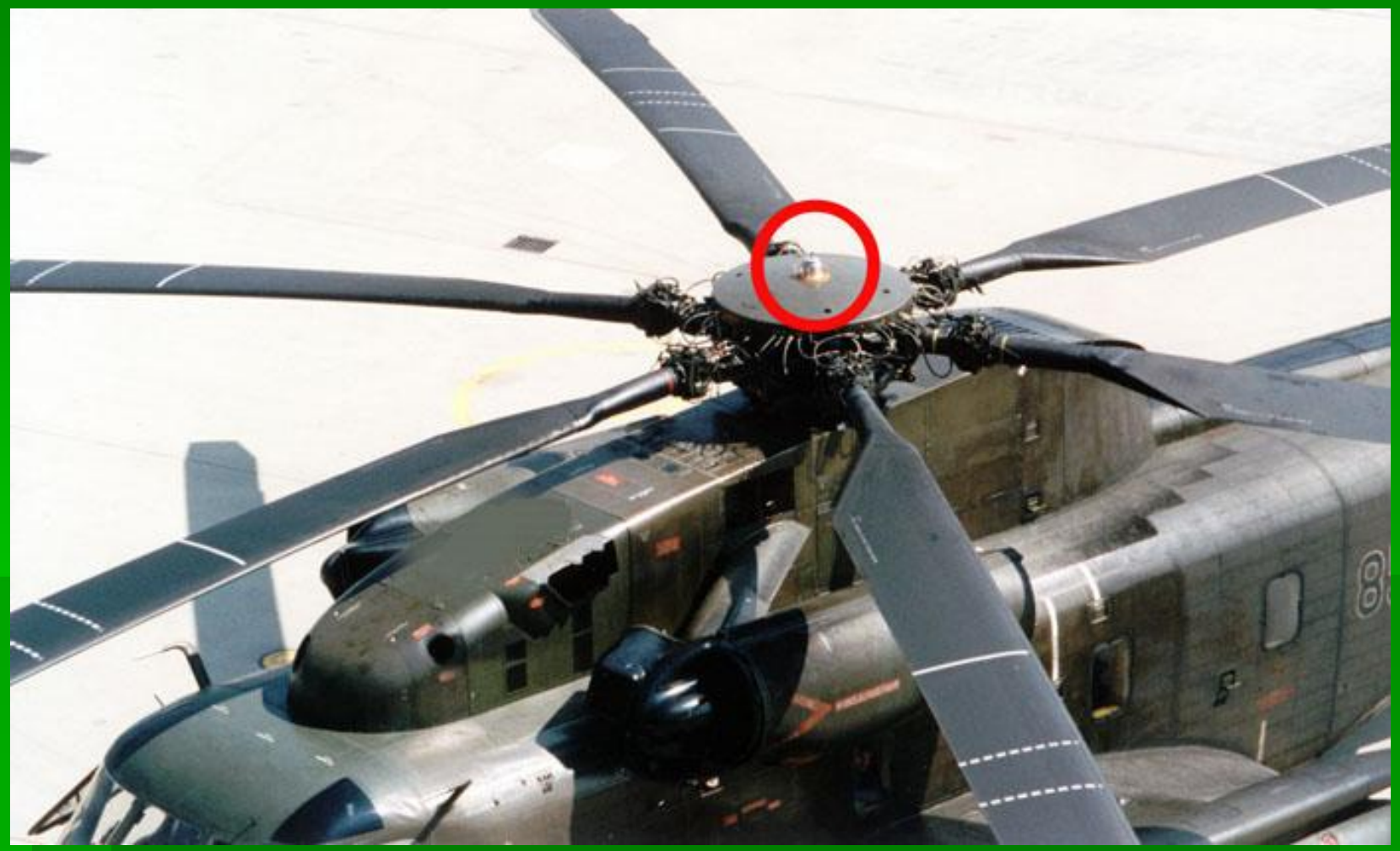
Force and vibration from helicopter blades