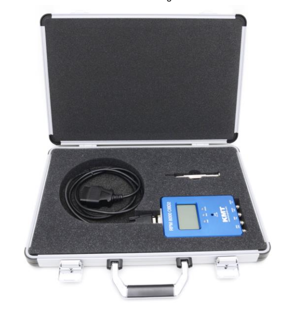
RPM8000OBD2 - in transport case